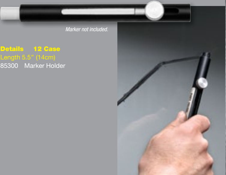
Marker not included.