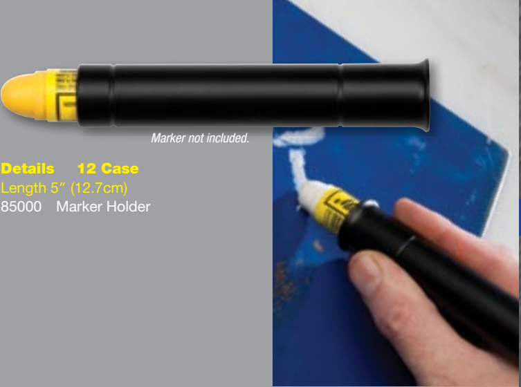
Marker not included.